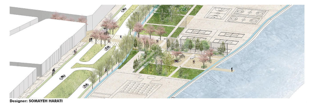
Abshar Green Ways | Isfahan